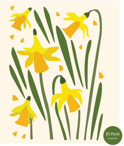
Flower posies for sale to support Canterbury Garden Club Reps Weekend of 7th & 8th September 10am - 4pm The Kiosk, Christchurch Botanic Gardens Te Màra Huaota o Waipapa www.chsgardens.co.nz

Championship Show presented by Canterbury Horticultural Society